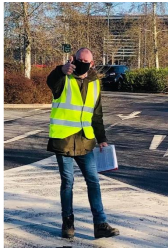
(One of the many volunteers)

The team has been very grateful for the frequent deliveries of fresh cake, biscuits and bacon sandwiches which had kept their spirits high!